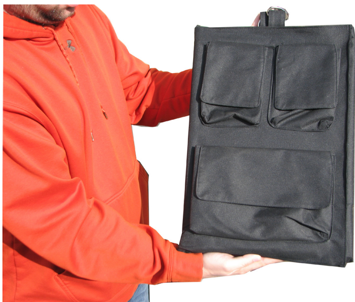
80 watt solar blanket shown folded

Whether you need to power a remote motor, charge any 12 volt battery or just have around for power emergencies, the SOLR-PAC mini is your solution.