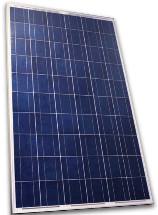
POLY-CRYSTALLINE SOLAR MODULE